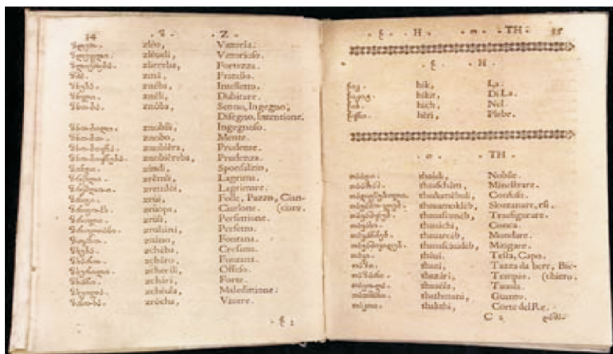
The Italian-Georgian Dictionary, printed in Rome in 1629