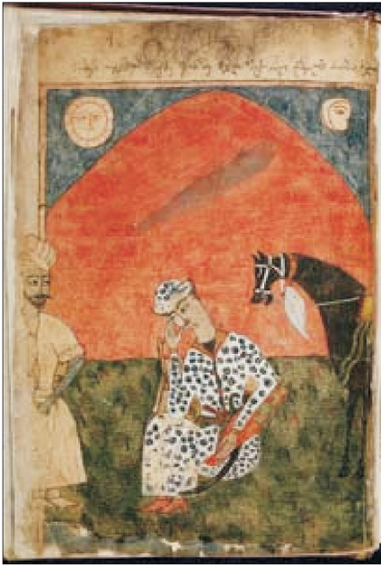
The Knight in the Panther's Skin Illustrated Manuscript, 1646

The creation of secular texts began in 10-11 th Centuries. Shota Rustaveli's The Knight in the Panther's Skin was written in the 12 th Century; a masterpiece considered to be one of the most important achievements of Georgian culture; the poem is preserved in numerous copies of different manuscripts. It is particularly interesting to note that The Knight in the Panther's Skin was often distributed in the form of illustrated manuscripts.